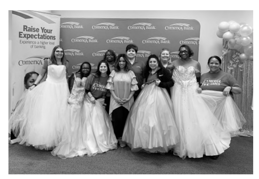
Comerica colleagues volunteer to help sort dresses as part of the fifth annual Metro Detroit Prom Dress Drive supporting Jackets for Jobs. In 2023, Comerica volunteers served their local communities by amassing more than 79,000 volunteer hours.

As a leader in the financial services industry, we understand and value the importance of clear and understandable public disclosure. Ensuring our transparency of these important measures, the Corporate Responsibility division issued its 15th annual Corporate Responsibility Report and, for the second year, published the Task Force on Climate-Related Financial Disclosures (TCFD) Report that included, for the first time, our disclosure of financed emissions.