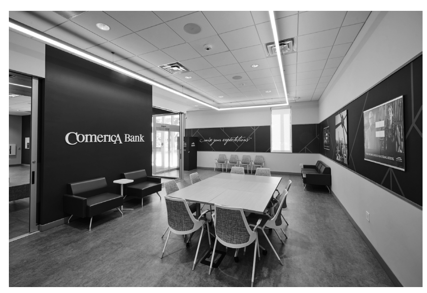
In 2023, Comerica introduced Comerica CoWorkSpaces™ as part of its latest services tailored for small business customers. These spaces provide Comerica small business customers with free access to office and meeting space.

• SizeUp by Comerica: We help small businesses leverage our data, tapping into competitive market research and insights to support informed business decisions. From creating benchmarks to understanding consumer spending, we are bringing big business resources to our small business customers.