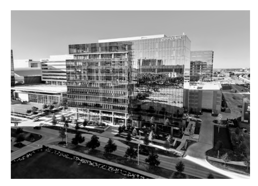
Comerica officially opened the doors to its new Business & Innovation Hub in Frisco, Texas. The office houses approximately 300 colleagues from a variety of teams, including technology and product management to front-line business units.